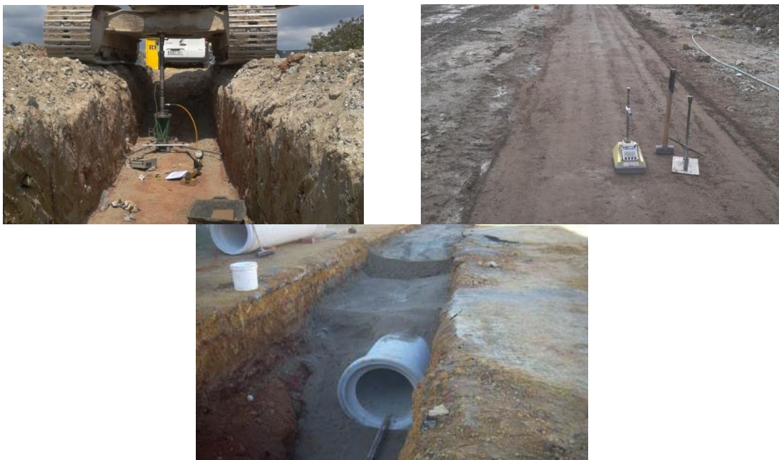
Image 1. Images from a restoration pipeline work.

Seville's cluster of partners for the CityLoops project includes the Municipality of Seville, LIPASAM (Municipal Solid Waste Management company), (Municipal Wastewater Treatment Management company) and IDENER (Private Research company). Together these partners are committed to CityLoops' approach to close the loops of waste material in the city, promoting a circular economy approach to the city's development.