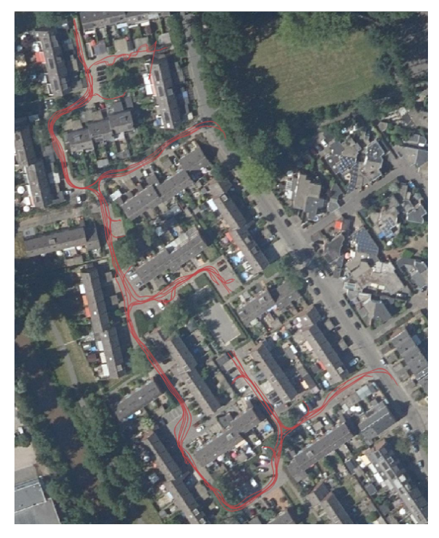
FIGURE 2. Lines of measurement in Griffiersveld.

missing data. Available data helps assess the quality of a road section by means of pavement unevenness, grout width, appearance and safety. Quantities by means of the total number of pavers or paving slabs, their original sizes and original product mass are currently not provided. The main actors involved are not addressed either, so it might not be an easy task to learn more about the product's manufacturer, the road's contractor, contracted repairmen, inspector or principal.