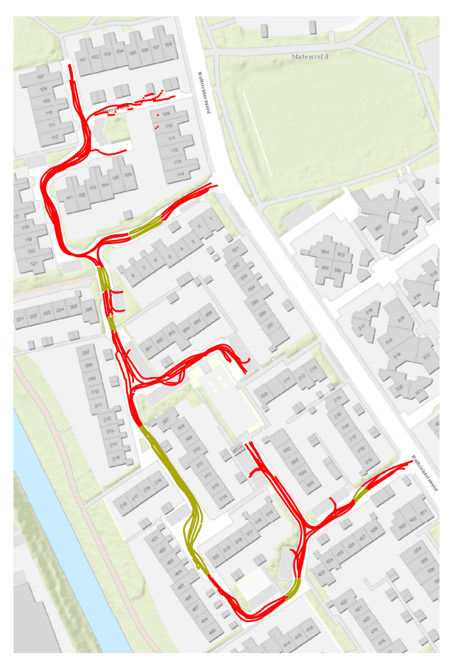
FIGURE 3. Applied pavement materials (red = concrete pavers, green = concrete paving slabs).

In a second scan process Light Detection and Ranging (LiDaR) data and panoramic high resolution images were collected on the 17<sup>th</sup> of June 2020. The scan equipment was mounted on the front of a van. This data, consisting of point clouds and images, gave insights into the location and status of surfaces and ob-